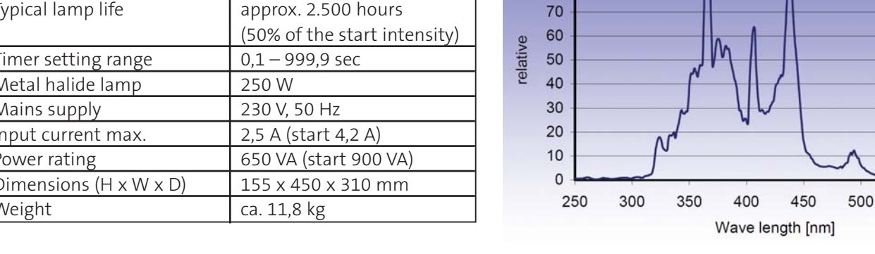
Spectrum bluepoint 2 easycure with coated quartz guide 320 nm - 500 nm