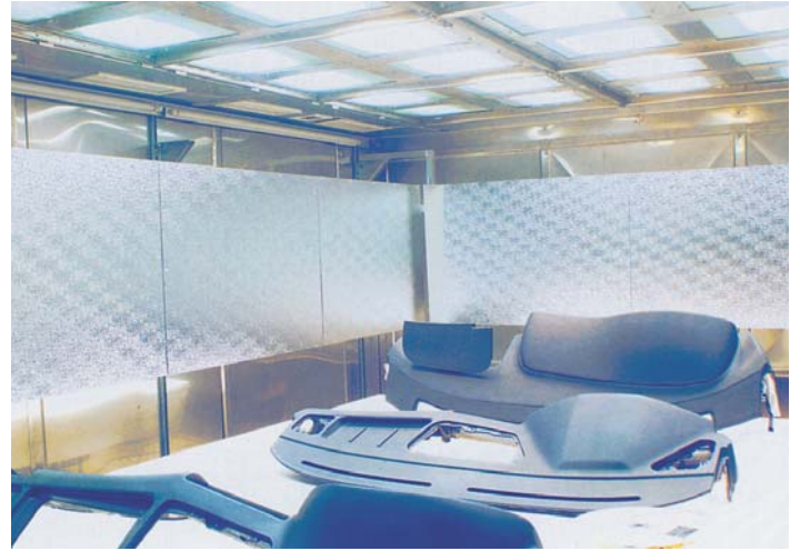
Climatic chamber with 24 SOL 1200

Beside conventional ballasts you can also use electronic power supplies (EPS) made by Hönle. These EPS supply the lamp with a rectangular current that improves the performance of the luminous flux. Thus, the power output increases by approx. 10%.