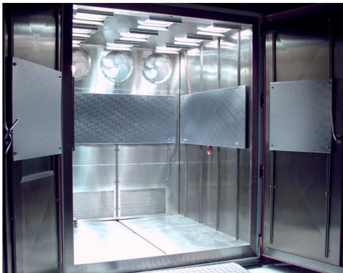
Climatic chamber with 9 SOL 2000 units

Special metal halide bulbs produce the light spectrum. Metal halides hermetically sealed inside the bulb are vaporised by an electric arc and generate a spectrum, which is close to that of natural sunlight. SOL units do not produce ozone .