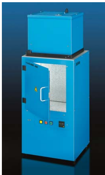
Sun simulation chamber UVACUBE 400

Alternative filters are available which can vary the spectrum to suit users needs.