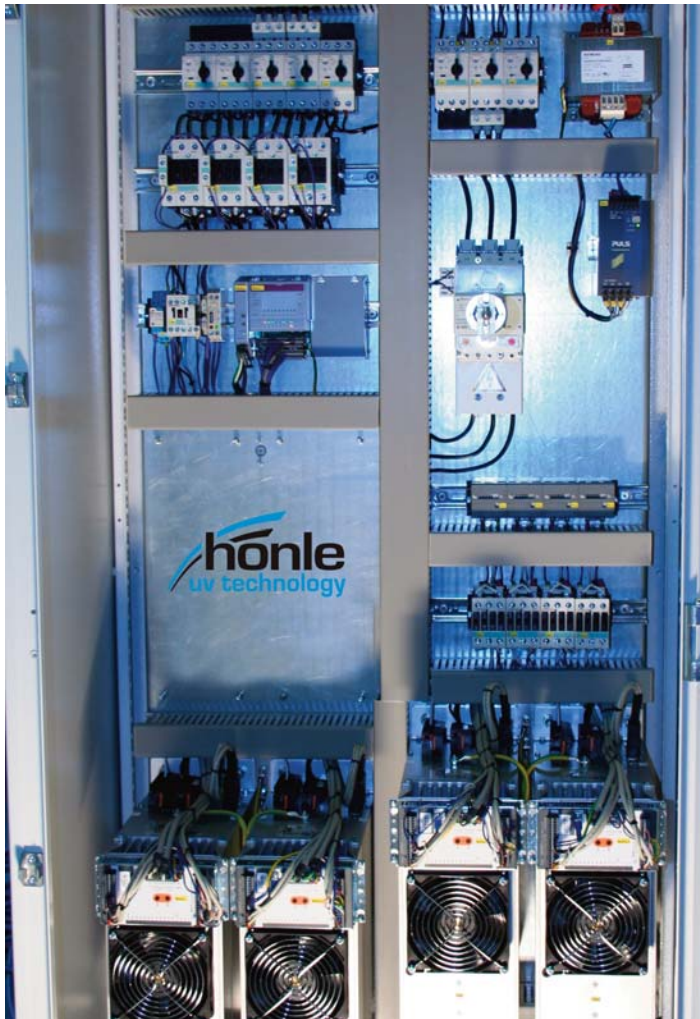
Sun simulation switch cabinet

The high efficiency and long lifetime of the Hönle metal halide bulbs makes solar simulation with SOL units economically attractive. They can be integrated into climate test cabinets and chambers as well. Thus, multi-parametric tests can be done. The units can be fixed outside the climate chamber and radiate through high-grade filter glass into the testing room. High quality filter glass protects the SOL units from humidity and temperatures from inside the chamber, and avoids undesirable interaction between the bulbs and external contaminants. By simply adding another glass filter, outdoor irradiation can be changed to indoor irradiation (or vice versa).