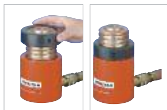
Locking collar feature permits non-hydraulic support of load.