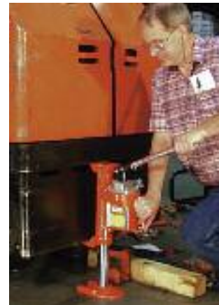
The J Series Toe Jack is an extremely rugged jack used here for lift truck service.